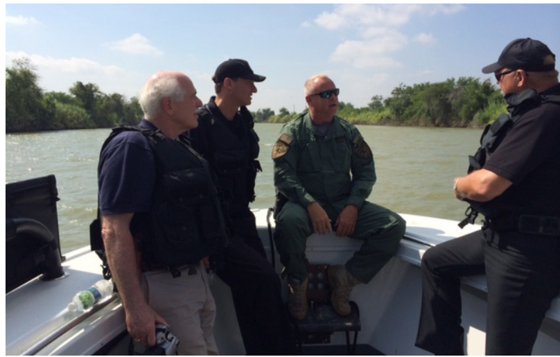
Border Patrol meets with sheriffs during July 2014 ‘fact-finding trip’ organized by FAIR.